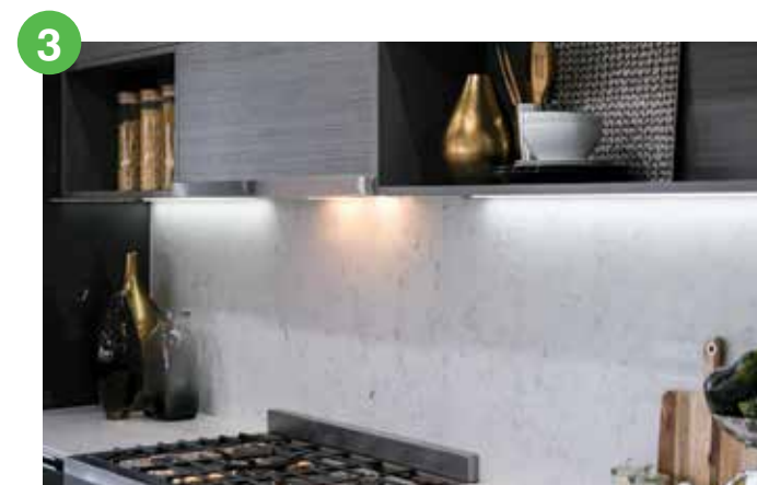
Slide-out range hood