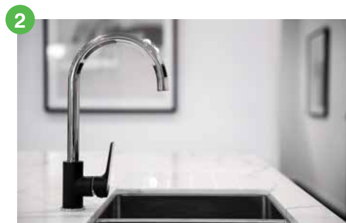
Black and chrome sink mixer