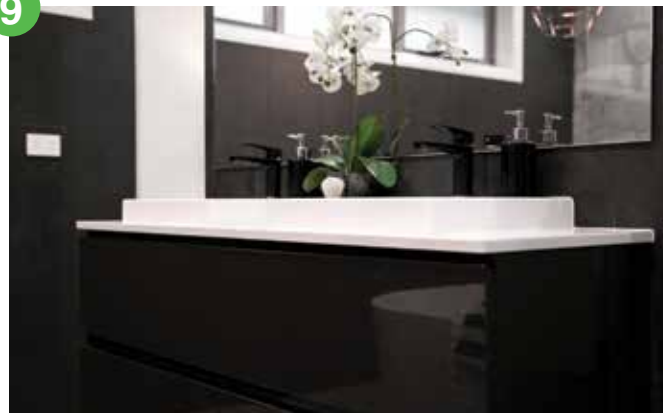
Reconstituted stone tops