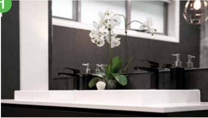
Polished edge mirror