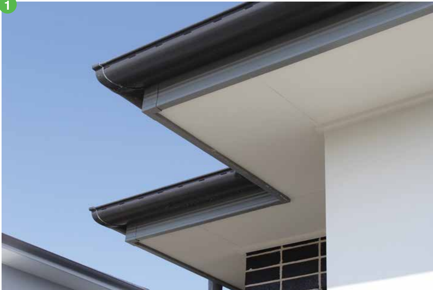
Half round gutter