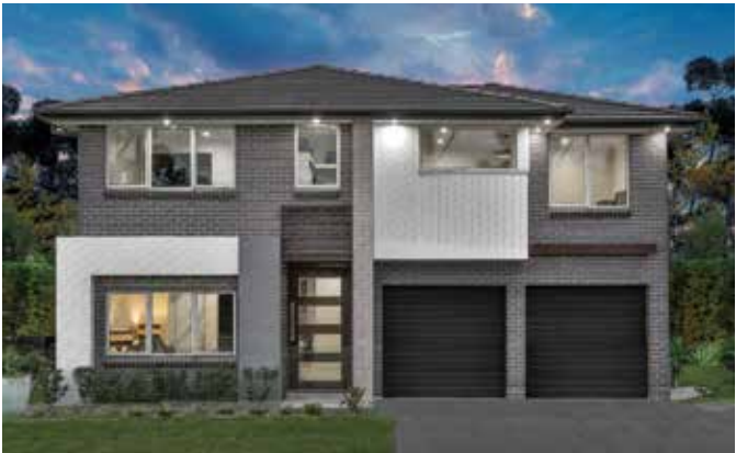
Panelift Garage Door

Designed to enhance the level of comfort and style throughout your new home, our Luxury Living Upgrade Package is just $7,980, offering true value for money and so much choice to ensure you'll love the selection of finishes and features available.