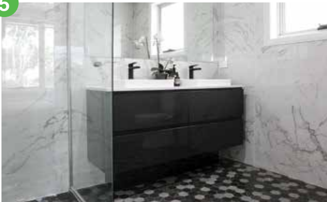
Semi wall hung vanity