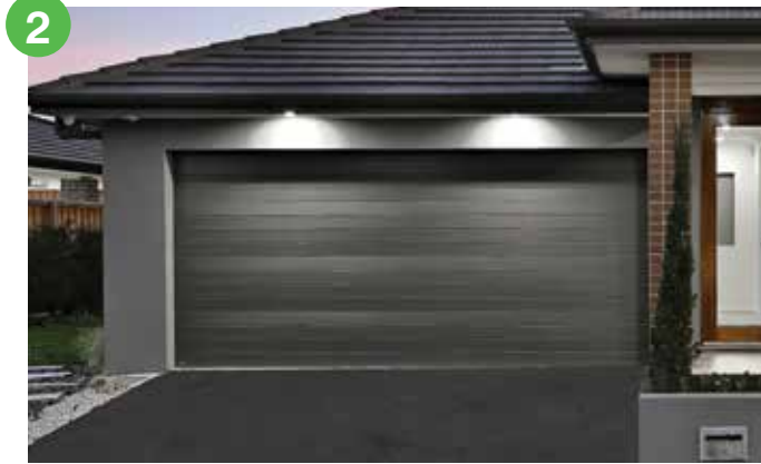
Steel garage door