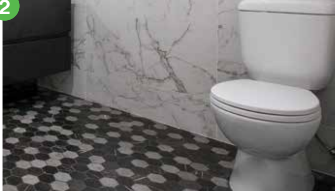
Close Coupled Toilet Suite (soft close)