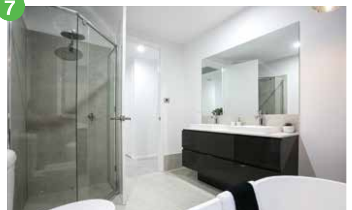
Semi frameless shower screen