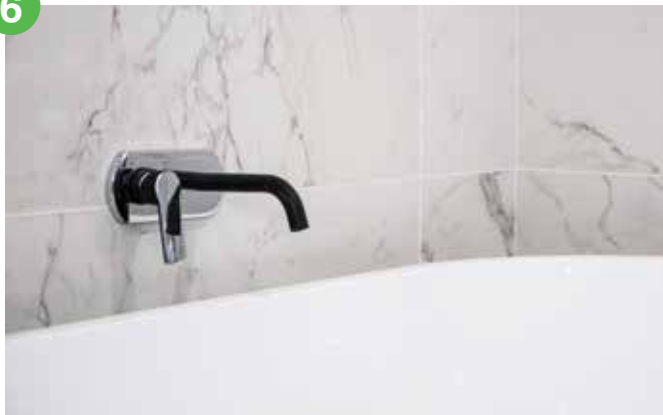
Black and chrome mixer