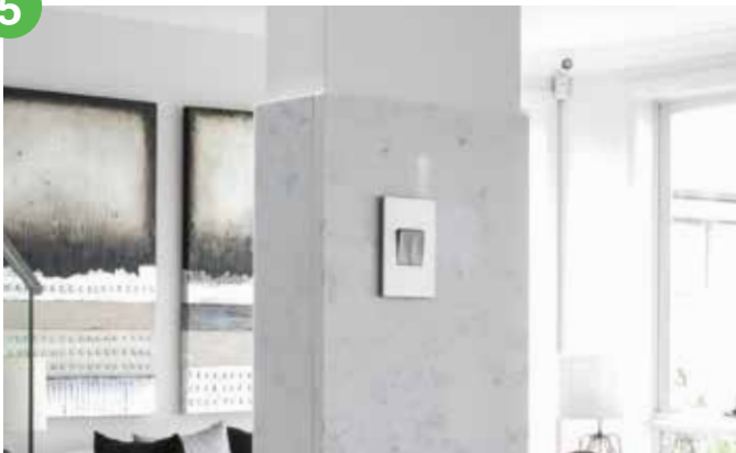
Square light switches