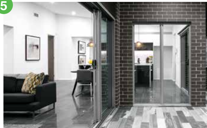
3 Panel stacker door (2100h x 2300w)