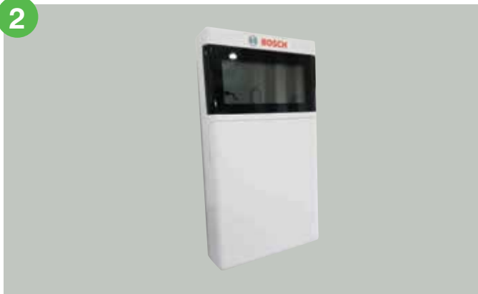
Three sensor alarm system