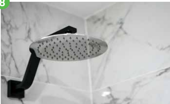
Black and chrome raindrop showerhead