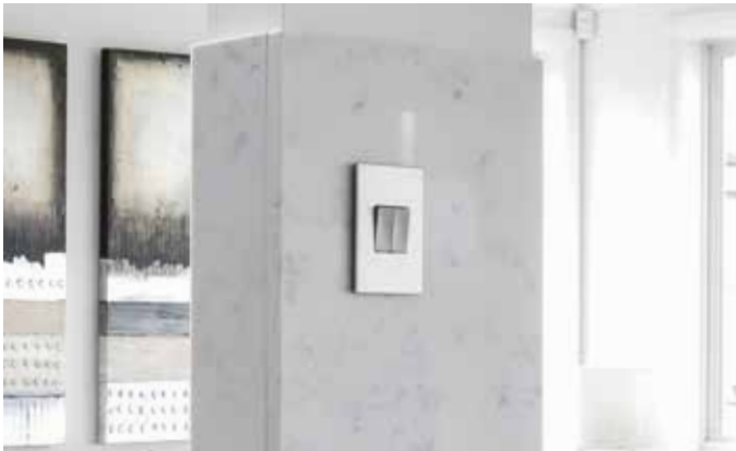
European square light switches

Designed to enhance the level of comfort and style throughout your new home, our Luxury Living Upgrade Package is just $7,980, offering true value for money and so much choice to ensure you'll love the selection of finishes and features available.