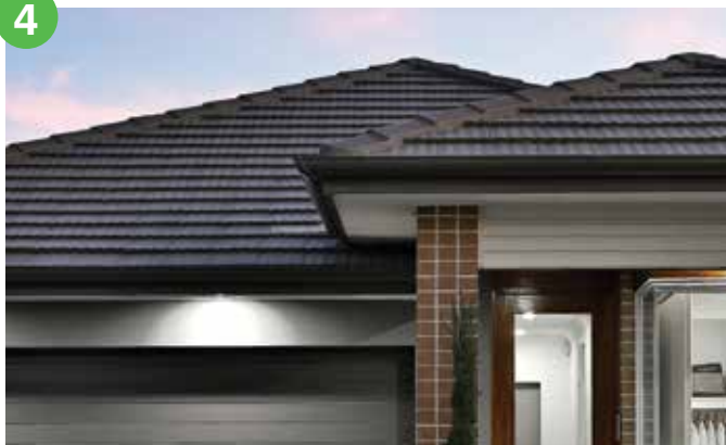
Contour Shaped Roof Tiles