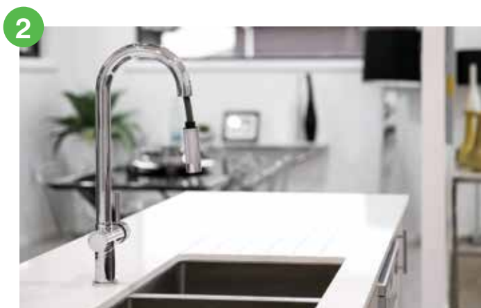
48cm Pull out sink mixer