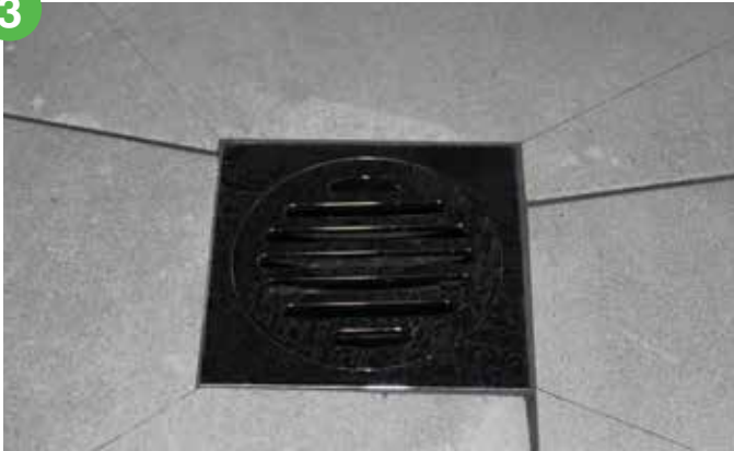
Chrome floor waste