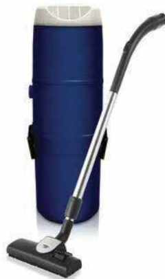
Ducted vacuuming system