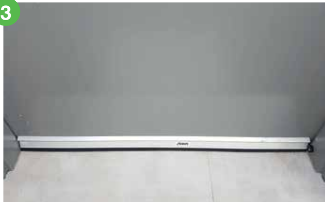
Bottom weather seal x 2 (820w)