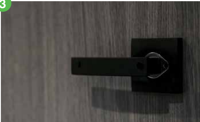
Stylish internal door handles